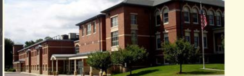
Lincoln Elementary School